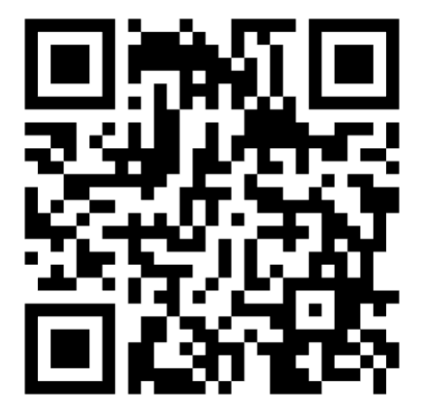
SIGN UP FOR ALERT MARIN